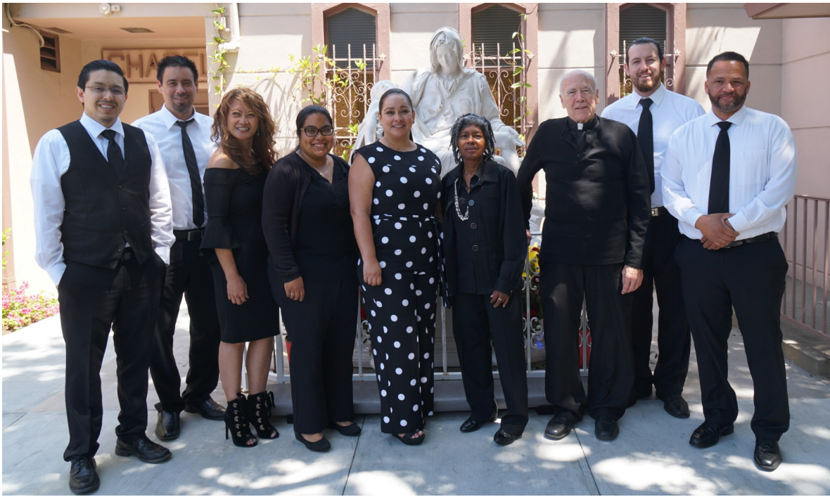
Above: Easter Sunday at St John Chrysostom at the 10:30am mass.