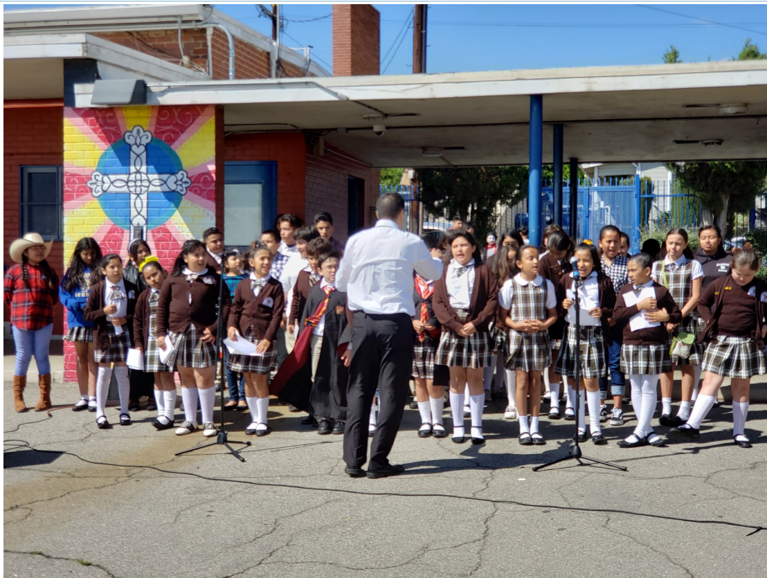
Below: Escolania Students performing their Spring concert program at Assumption, May 19, 2019