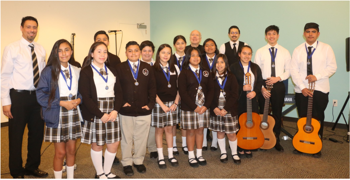
Above: Escolania students performing 'Amazing Grace' at an event for Ascending Lights.