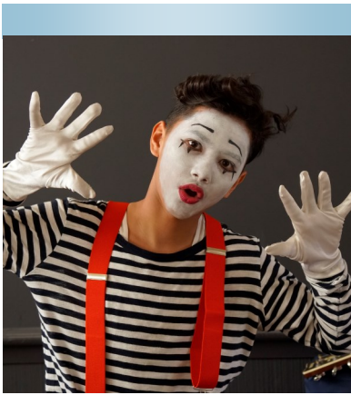
Assumption and Escolanía in Boyle Heights, "A Catholic Magnet School in the Communication Arts," in more ways than one.