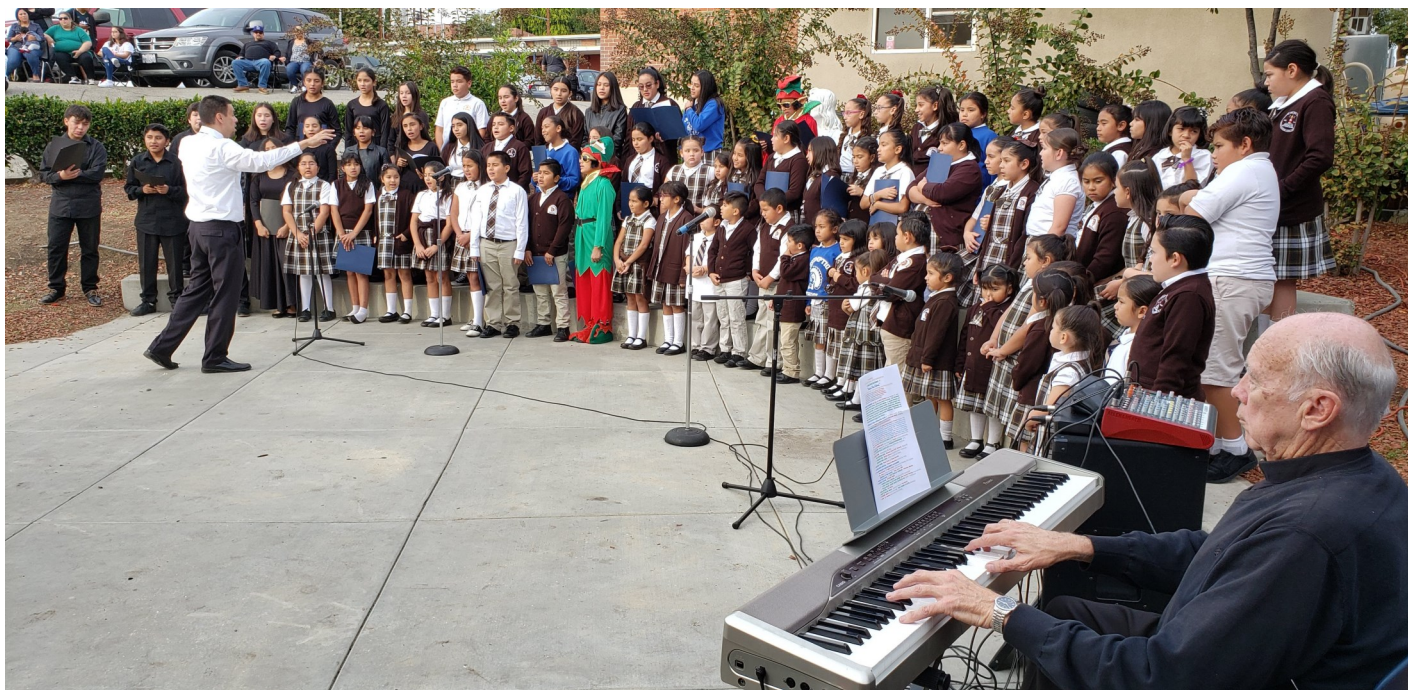
Above: The Escolania students performing their Christmas Program at Assumption School in Boyle Heights on December 9, 2018