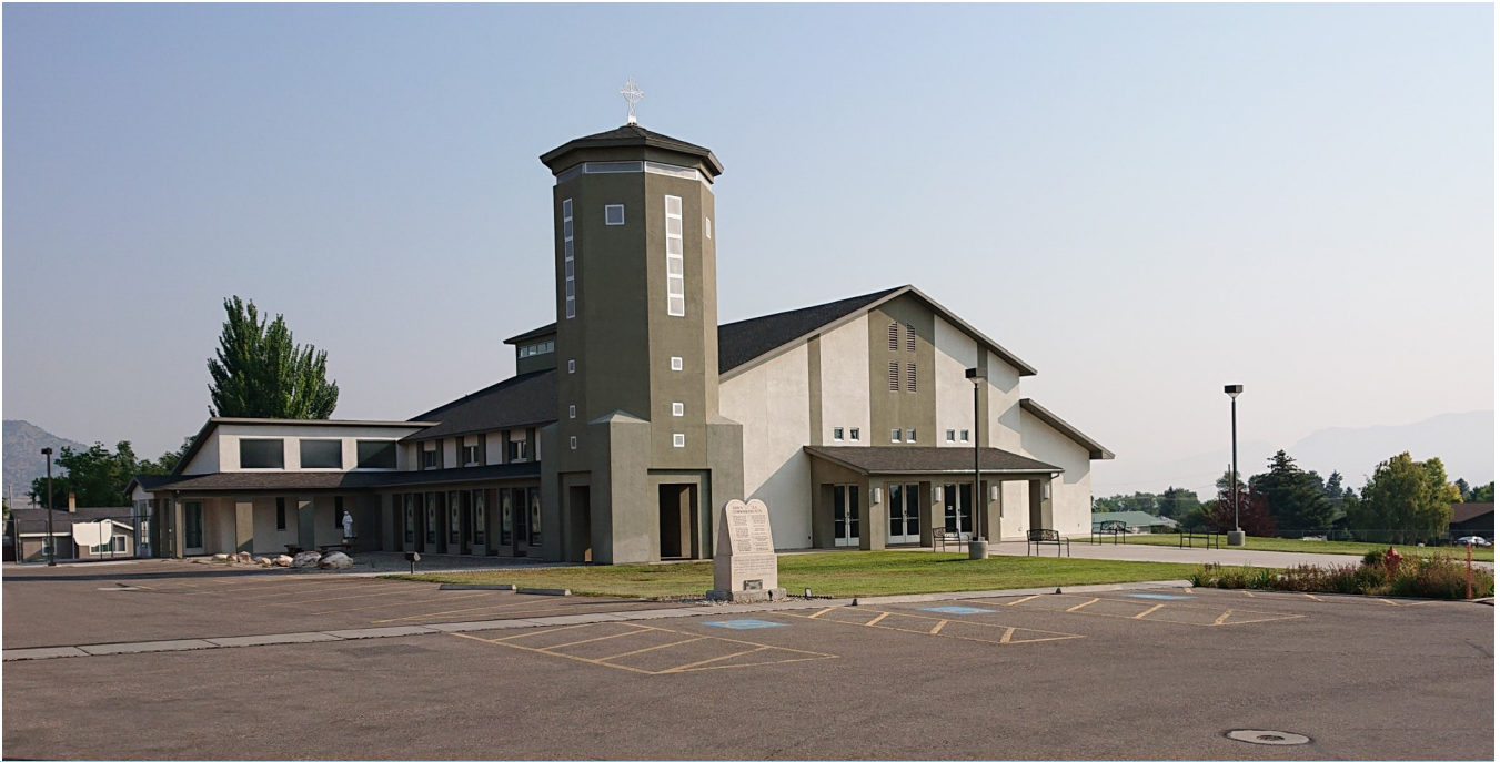
Above: The Schola adults and Escolania students visiting Sacred Heart Catholic Church, summer 2018 in Ely, NV.