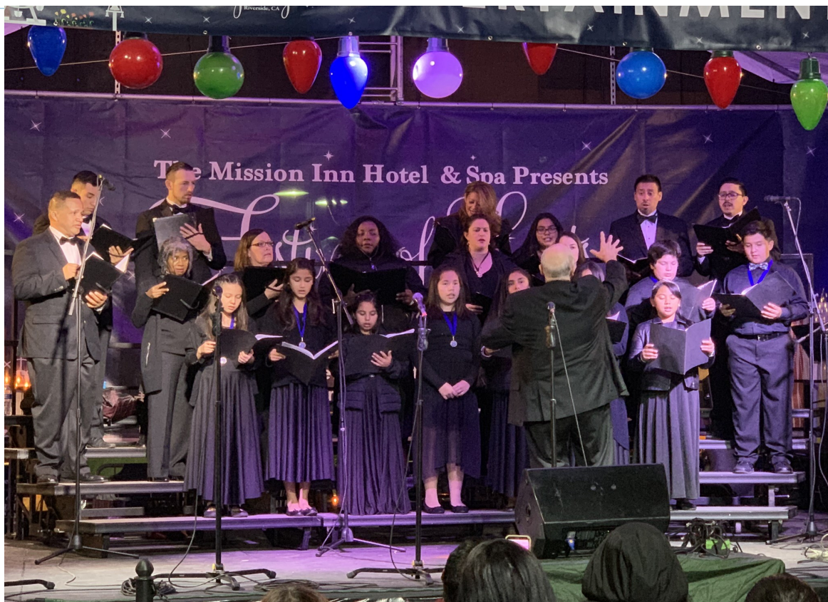
Below: The Schola adults and select Escolania students performing at the Riverside Festival of Lights' Main Stage on December 16, 2018.